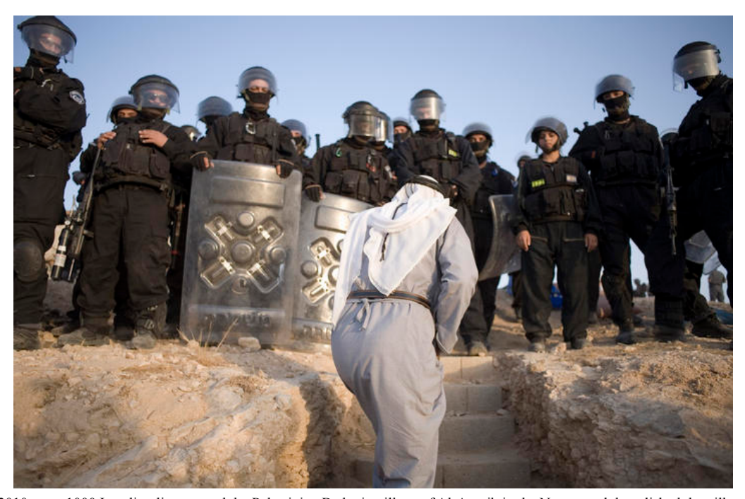
In July, 2010, over 1000 Israeli police entered the Palestinian Bedouin village of Al-Araqib in the Negev, and demolished the village to make room for a forest planted by the Jewish National Fund, a close partner of the Arava Institute. Al-Araqib has since been rebuilt and demolished four more times. The Arava Institute. located in the Negev, has not commented on the demolition of Al-Araqib.

Boycott the Arava Institute's "With Earth and Each Other: A Virtual Rally for a Better Middle East" FACT SHEET October 20, 2010